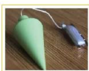
Metal drop ball