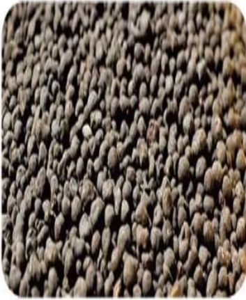
Forest Epidemic Prevention