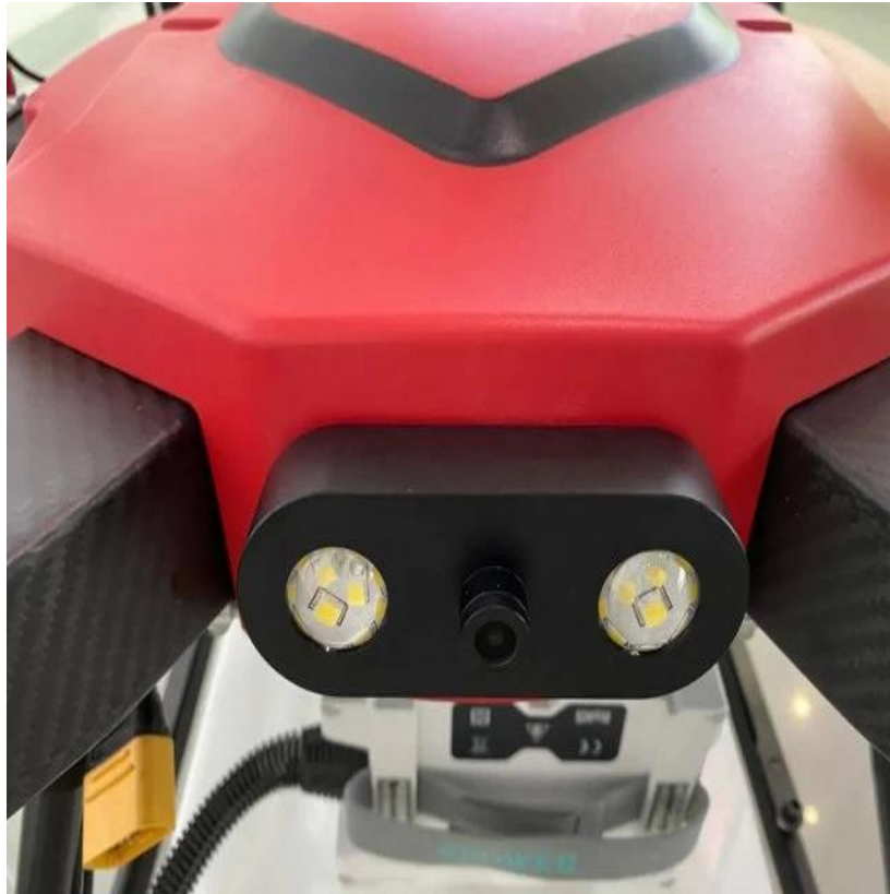
Modular design for convenient maintenance