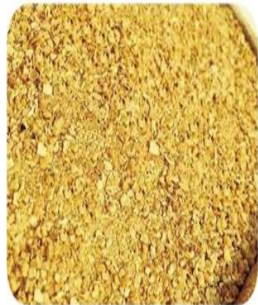
Killing Mosquitoes, Flies And Rats