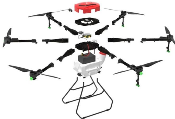
Equipped with 4 twin sprinkler heads