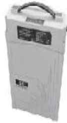
Intelligent Quick Charging Battery