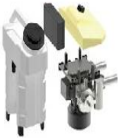
Detachable tank +Engine