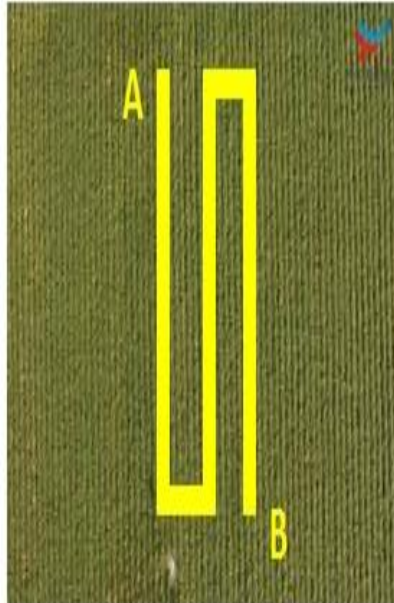
Dynamic AB point flight