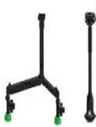
Pressure Nozzle & Centrifugal Nozzle Optional