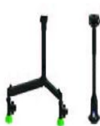
Pressure Nozzle & Centrifugal Nozzle Optional