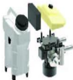
Detachable tank +Engine