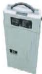
Intelligent Quick Charging Battery